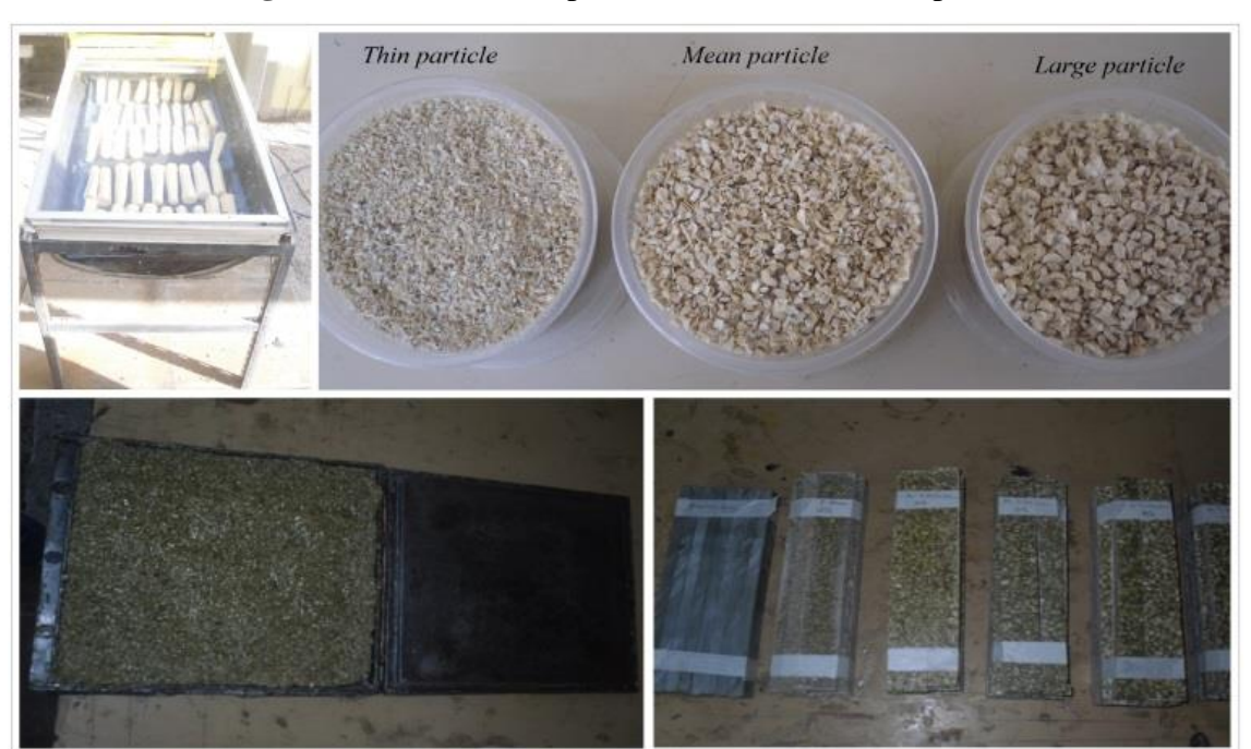
Figure 2. Obtained composites and manufactured plates.