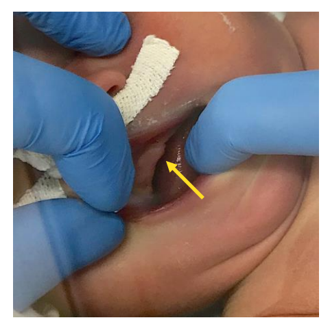
Figure 4. Upper gum pad without the presence of depression (arrow).

After the dental team diagnosis, the periodic change in the positioning of the OT was determined in conjunction with the multidisciplinary team (nursing and physiotherapy) every 24 hours. Subsequently, stabilization of the upper gum pad was observed after 4 days without the presence of depression (Figure 4).