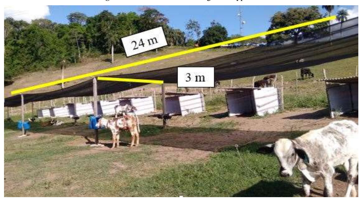
Figure 2. Measurement of the argentine-type calf.