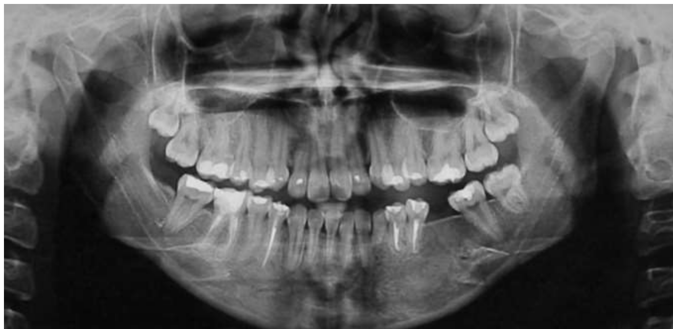
Figure 3. Radiographic findings after 4 years of radiographic follow-up, with no signs of recurrence.

After diagnosis, we chose to marsupialization the cystic lesion and follow with enucleation, and the lesion, associated with the included-tooth 33, was also removed. After 24 months of clinical and radiographic follow-up every six months, a recurrence was observed in the lower incisors region and a new surgical intervention was performed, enucleation was followed by peripheral osteotomy. Currently, the patient has for 4 years been undergoing radiographic follow-up since the last surgical procedure, with no signs of recurrence and with preservation of masticatory function and good aesthetics (Figure 3).