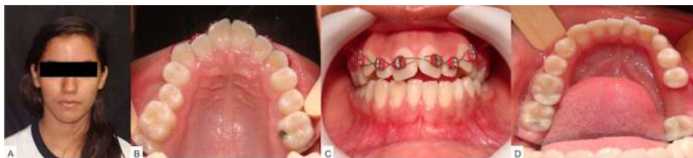
Figure 1. Extra-oral examination (A) and oroscopy without significant alterations. Mention for absence of swelling or tooth displacement (B,C,D).

A female patient, 12 years old, sought care at the Stomatology Outpatient Clinic of the Federal University of Ceará, due to an intraosseous lesion discovered in a routine panoramic radiographic examination requested for orthodontic purposes. Extra-oral examination and oroscopy revealed no noteworthy alterations (Figure 1). Panoramic radiography revealed an extensive well-defined, unilocular, radiolucent, with irregular margins in the mandibular symphysis region extending to the posterior bilateral mandibular in the region of teeth 34 and 43, with approximate dimensions of greater than 4.0 cm x 1.5 cm (Figure 2), and (according to the patient) with an evolution time of approximately nine months.