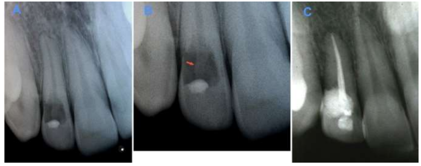
Figure 2. A- Radiographic aspect of tooth 12 with radiolucent area in the cervical region of the crown. B-: Details of the periapical radiography with an image suggestive of the root canal in the center of the crown (arrow). C- 39-month radiographic control showing the integrity of the periodontal ligament.

On probing the labial surface, there was profuse bleeding and a 5 mm gingival sulcus depth (Figure 1F). Periapical radiography showed integrity of the periodontal ligament and a radiolucent area that involved the cervical and middle third of the crown (Figure 2A). It was also possible to notice an image suggestive of the outline of the root canal in the center of the lesion (Figure 2B).