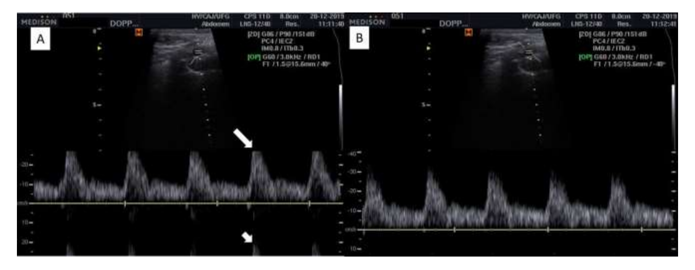
Figure 4 . Arterial spectral tracing of an adult mixed breed female dog, using a 7.5 MHz linear transducer demonstrated aliasing artefate (white arrows) caused by the baseline positioning (A). Corrected spectral tracing after repositioning the baseline, without modifying the PRF (B).