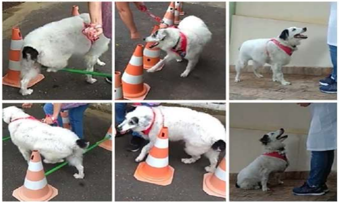
Figure 2. Sequence of active exercises