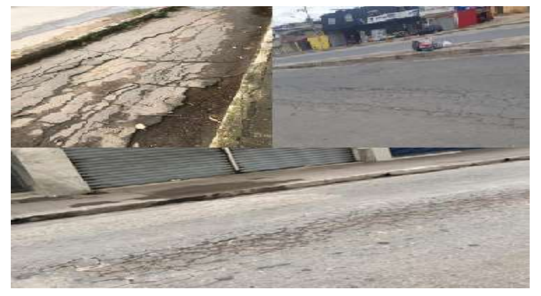
Figure 5. Interlocking cracks without preferential directions

To alleviate such causes, there are maintenance and restoration activities that are recommended by the DNIT Standard 154/2010 and are based on the improvement of drainage, replacement of sub-base, base and covering, resurfacing, or reconstruction of the application. It should be noted that the resurfacing and sealing layer, which works as superficial repairs, are efficient both for interlocking cracks of the block type and for the interconnected cracks of the alligator leather type, in this way, they have the same principle of repair for both pathologies (DNIT, 2010; Salomão et al., 2019).