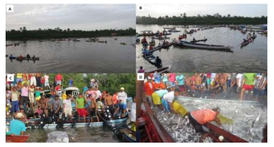
Figure 3. Seining for mapará. A) Formation of the circle, B) and C) Closing the seine; D) Removal of the fish from the net.