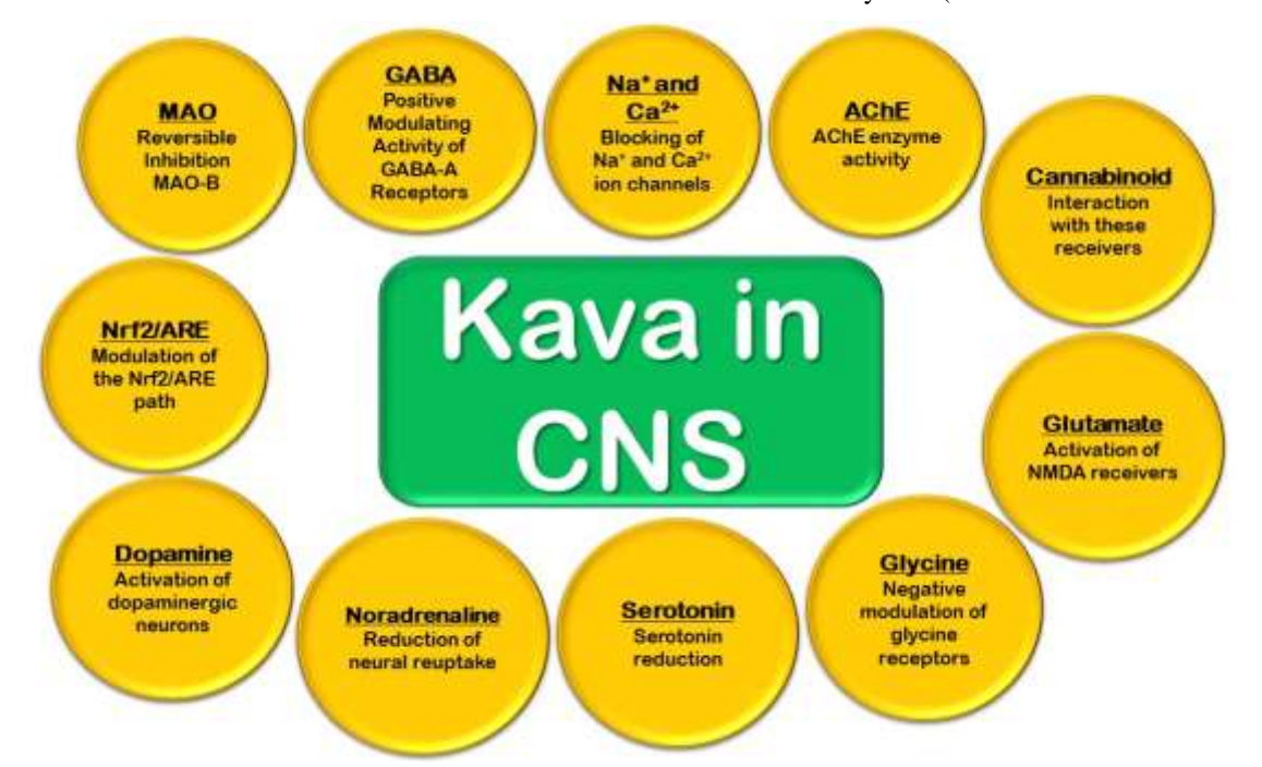
Figure 2. Scheme of the mechanisms of action of kava in the central nervous system (abbreviations in the main text).