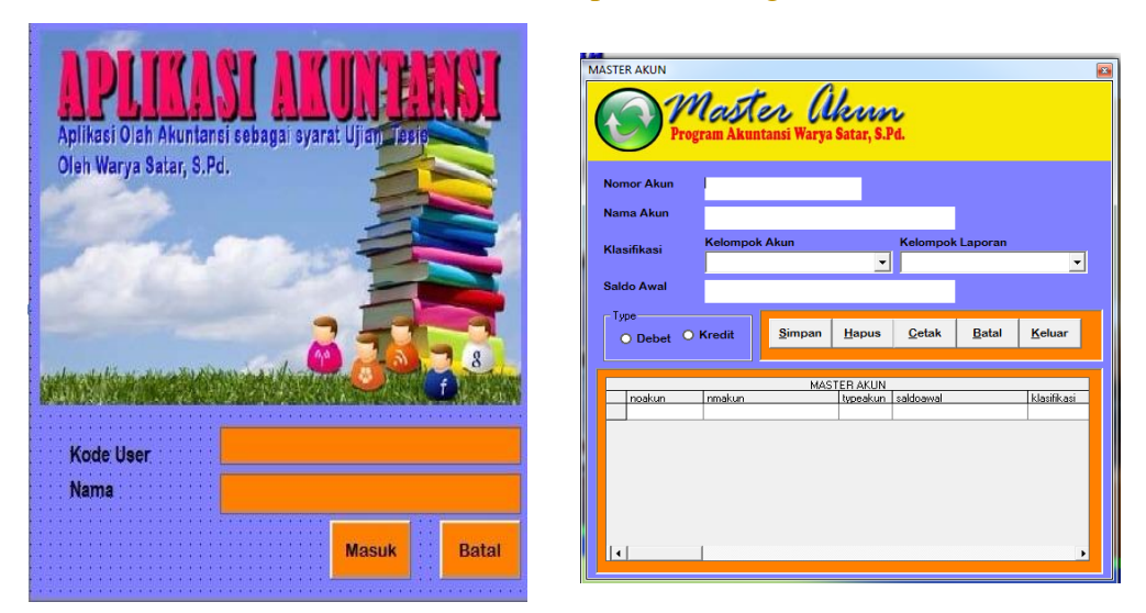
Figure 1. Display of Teaching Material Application and Data Input