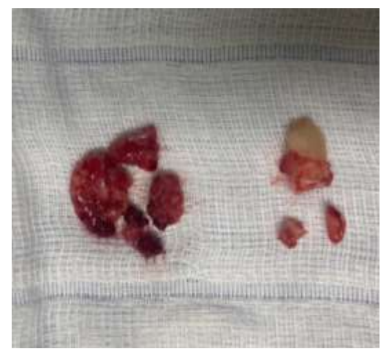
Figure 5 - The cystic capsule and tooth 13 after extration.

We opted for curettage of the surgical site to remove the cystic capsule, extraction the tooth and refinement of the remaining bone borders. Repositioning and inter papillary suture of the flap were performed. (Figure 5)