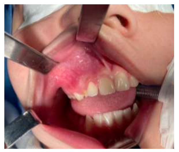
Figure 3 - The surgical procedure under general anesthesia for enucleation of the cystic capsule and exodontia of tooth 13.

It was decided to perform the surgical procedure under general anesthesia for enucleation of the cystic capsule and exodontia of tooth 13, due to malposition and making orthodontic traction unfeasible. (Figure 3)