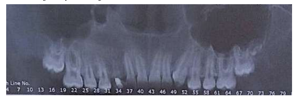
Figure 6 – The computed tomography of the 6-month postoperative period shows satisfactory bone formation at the site of the enucleation of the dentigerous cyst and no signs of recurrence.