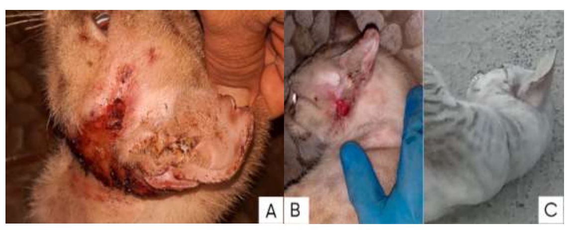
Figure 3. (A) Remission of the lesions after one month of treatment. (B) Evolution of the treatment response after 4 months. (C) Animal after treatment, with complete remission of the lesions and weight gain.