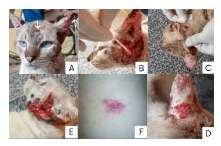
Figure 1. Clinical aspects of animal with suspected sporotrichosis. (A) Cat with lesions on both face and ears (arrows). (B) Facial skin lesions with serosanguinous and ulcerated aspect, and also collection through. (C) Lesions in the skull and ears, with a crusty, ulcerated appearance and imprint collection. (D-E) Lesions had a circular and elevated appearance, however, most lesions had an erythematous, ulcerated, flaky, serosanguinous character, devoid of purulent and non-pruritic contents. (F) The owner reported that he too had lesions in the abdominal region that looked similar to those of the animal.