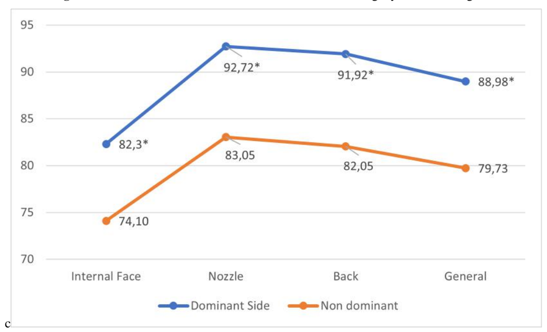
Figure 2 – Demonstration of the interaction between kicking style and kicking side.