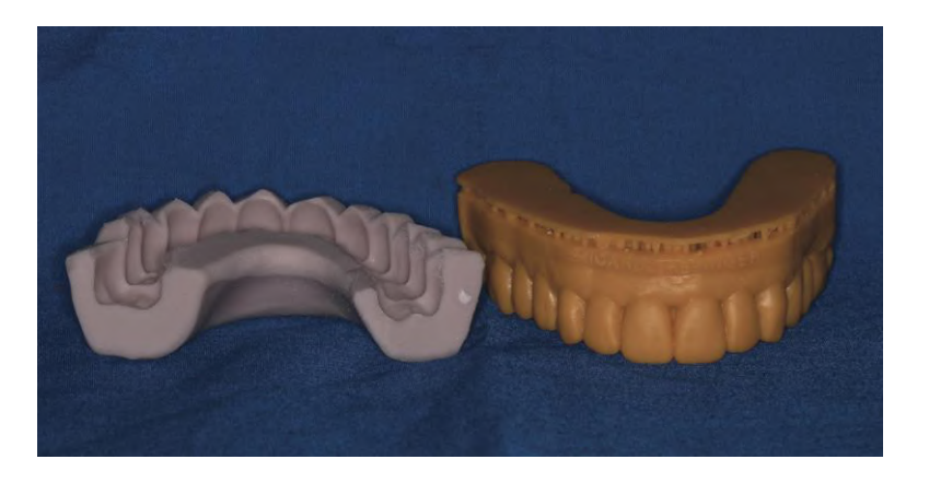
Figure 3 - Silicone guide for building the mockup on the left and the patient's upper arch 3D model on the right.