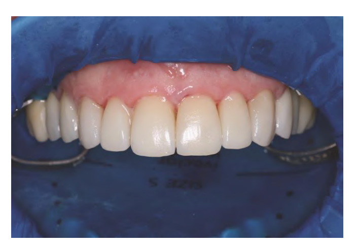
Figure 8 - Proof of ceramic laminates with try in paste.