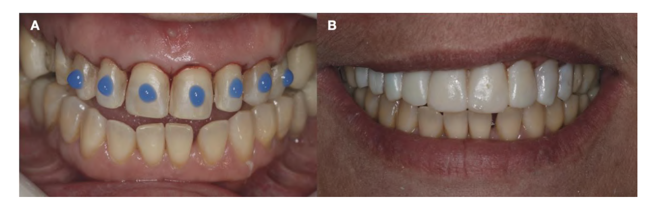
Figure 6. A- Substrate preparation for making temporary restorations. B - Temporary restorations installed.

Since the CAD/CAM system was the method of choice for making the ceramic veneers, the next step was to perform gingival retraction and subsequent intraoral scanning of the prepared region (FIGURE 6).