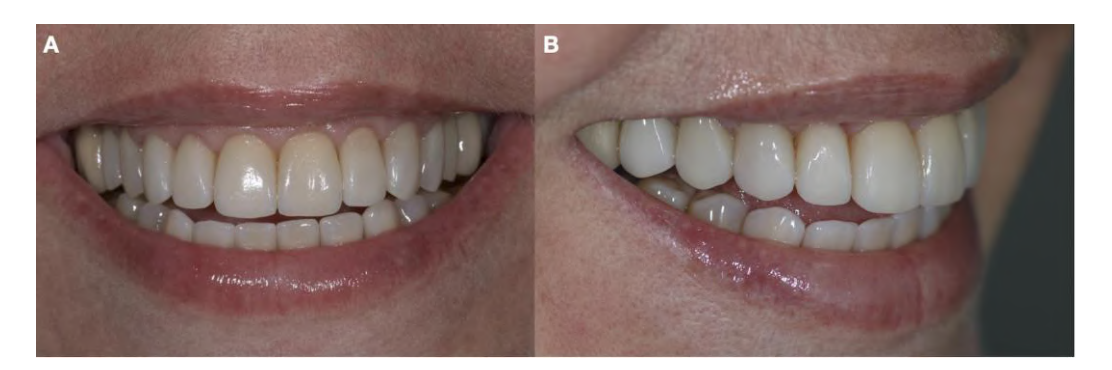
Figure 10 - A and B - Control after 3 year.