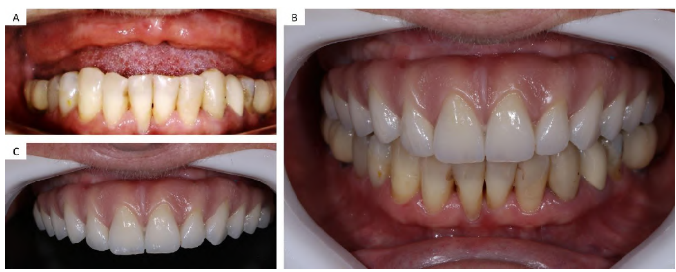
Figure 6 A and B - Sequence of the prosthetic step at case 3. C. Final appearance of metal-ceramic dentogingival implant-

dentogingival fixed protocol type was due to several factors: 1st) The patient's desire to have fixed teeth; 2nd) Presence of 7 implants, ensuring good support on the anterior lever arm; 3rd) Presence of prosthesis on metal-ceramic implants in the lower region, making the materials compatible, and less wear of the prosthesis; 4th) Need for moderate lip support, which can be achieved with this type of prosthesis. Regarding metal-ceramic prostheses, the excellent esthetics compared to resin prostheses, as well as less wear and staining, stand out. However, repairs caused by chipping or fracture of porcelain are more difficult to repair than acrylic resin prostheses (Figure 6 A-C).