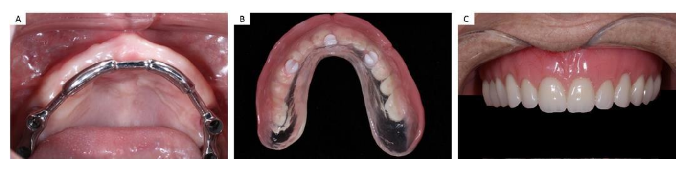
Figure 5 A and B - Sequence of the prosthetic step at case 2. C. Final appearance of acrylic resin implant-supported prosthesis.

After verifying the osseointegration of the six 3.8 x 13mm morse taper implants (SIN implants, SW Strong, Brazil), the implants were reopened and healing devices were installed. The choice for the resin protocol was due to several factors: 1st) The patient's desire to have fixed teeth; 2nd) The Presence of 6 osseointegrated implants, ensuring good support on the anterior lever arm; 3rd) The presence in the lower jaw of an acrylic implant prosthesis, making the occlusion between the two prostheses compatible and thus causing less wear on the artificial teeth; 4th) Adequate lip support with this type of prosthesis; 5th) Cost-effectiveness and ease of repair of the prosthesis in relation to ceramic prostheses (Figure 5 A-C).