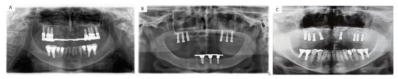
Figure 3 - Panoramic radiograph to evaluate implant placement. A. Installation of 7 external hexagon connection implants of 4.1x 11.5 mm after 18 months of bone grafting; B. Installation of 6 morse taper implants of 3.8 x 13mm concomitantly with bone graft; C. Installation 8 4.1x 11.5mm external hexagon connection implants after 18 months of bone grafting.