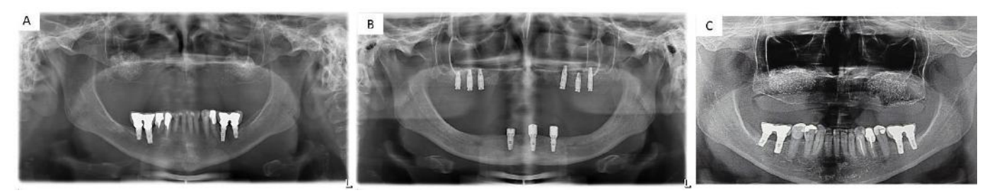
Figure 2 - Panoramic radiograph for evaluation and analysis of the bone graft in the bilateral region of the maxillary sinus after 12 months of graft. A. Panoramic radiograph at case 1; B. Panoramic radiograph at case 2; C. Panoramic radiograph at case 3.

Prosthesis test, adjustments, and orientation; 8th) control.