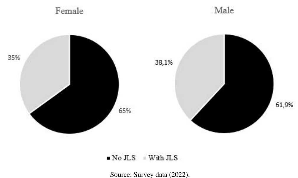
Figure 2 - Distribution of Social Jet Lag (JLS) proportions in university students according to gender, Juazeiro do Norte, CE, 2022.

The data indicate that most college students (77; 73.3%) had levels of excessive daytime sleepiness, with the highest proportion of college students being male (35;83.3%) (Figure 3A). Most university students had poor sleep quality (78; 74.3%), with a higher proportion of females (47; 74.6%) (Figure 3B).