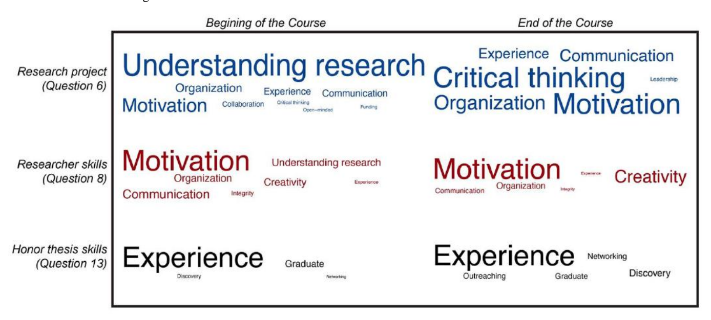
Figure 2 - Open-ended questions (# 6, 8, and 13) from the survey applied at the beginning (pre-survey) and end of the course (post-survey) (Table 1). The size of each word is proportional to the number of times students cited it. For example, bigger words are the ones that were cited more times. The surveys were applied in two semesters (Fall 2021 and Spring 2022) for an honors orientation undergraduate course.

The open-ended questions 6, 8, and 13 from the survey (Table 1) were applied to the students to determine what skills the students believe to be essential to start a research project (question 6), what are important researcher skills (question 8), as well honors thesis skills (question 13) (Figure 2).