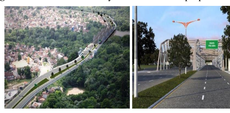
Figure 2. Areas that allows easy access of cars and people to APA Belém.

The main public task comprised the 4.7 km extension of the four-lane Avenida João Paulo II, (Pará, 2018) which has not been followed by the implantation of sanitary sewage collection network even in the stretch which passes through the APA Belém. In spite of the great importance of urban mobility for the inhabitants of Belém and Ananindeua, the impacts on APA Belém were reported throughout the execution of the public works between 2013 and 2018, caused by the elimination of riparian vegetation, removal of great amounts of soil and the construction of two bridges with 176 m and 224 m respectively over lake Bolonha and Agua Preta. On the other hand, on the conclusion of works, followed by more access to cars and people, the preservation of the lakes of APA Belém was endangered, as Figure 2 demonstrates.