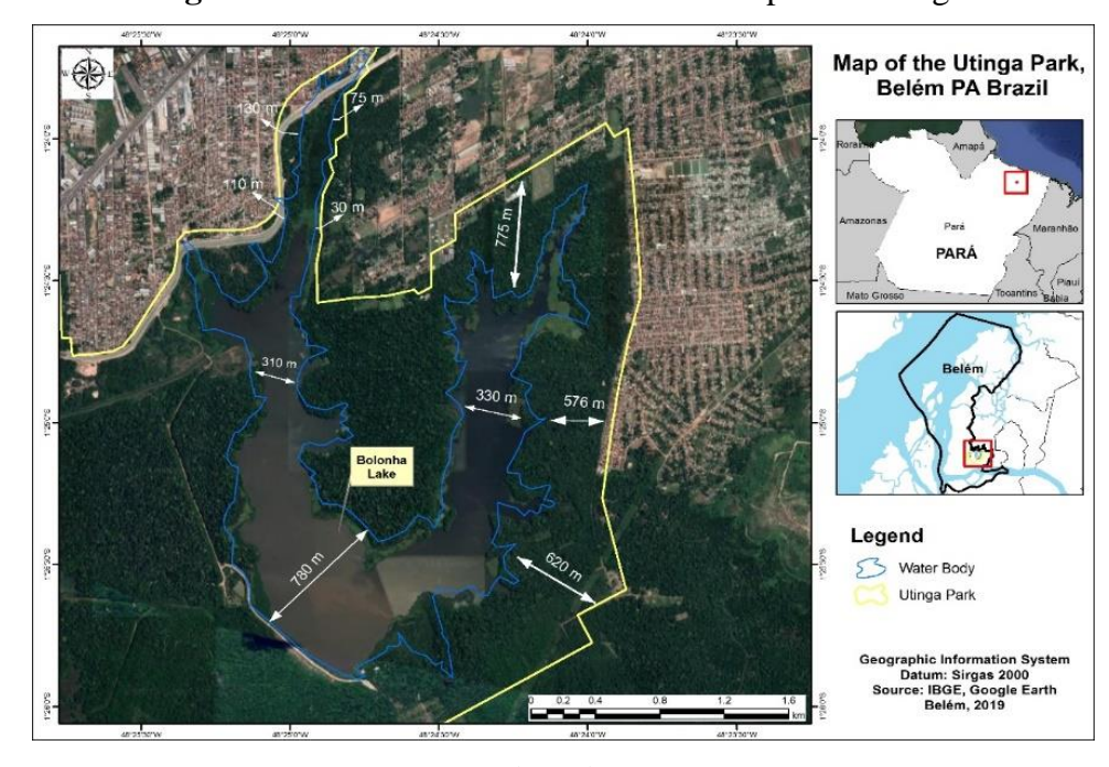
Figure 3. Distance between lake and its respective margins.

The boundaries of the APA's riparian vegetation were evaluated. ArcGis identified a variation between 30 m and 1500 m from urban expansion sites till the lake's banks. Denser vegetation area (riparian vegetation up to 1.5 km) in the southern, southeastern and southwestern regions still provides protection close to the water sources. However, shorter distances (up to 30m) verified in the north, east and west of the lakes already reveal the enormous difficulty to preserve these water environments. According to the Brazilian Forest Code, the minimum distance between the preservation areas in the environs of the water bodies should be 200 m from each margin. Such distance does not occur in most of lake Bolonha. with shorter distances at several sites, as Figure 3 demonstrates.