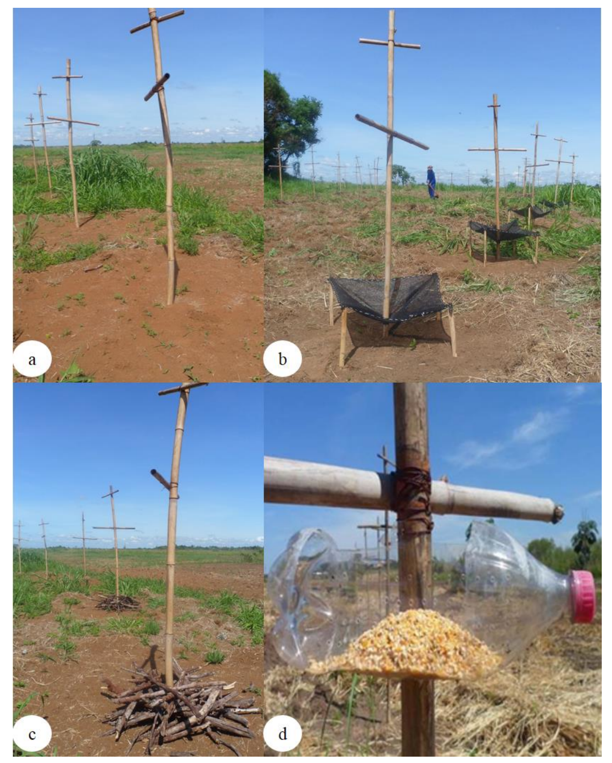
Figure 2. Implantation of artificial perches in the field (Dourados, 2017). (a) artificial perch model of the control treatment, T1; (b) artificial perch model with seed collectors from treatment 2; (c) artificial perch model with brushwood transposition occurring in treatments 3 and 5; (d) artificial perch model occurring in treatment 4 and 5.