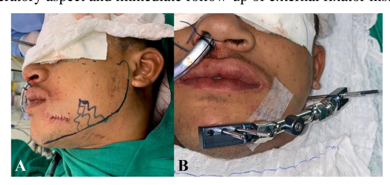
Figure 2. Trans-operatory aspect and immediate follow-up of external fixator installation.

In the intraoperative time, a maxillary-mandibular blockade using steel wire was performed, surgical cleaning with copious irrigation with 0.9% saline and 2% chlorhexidine, removal of viable projectile fragments and suture of the entrance orifice. Closed fracture treatment and stabilization using the external fixation system were chosen by adapting an external wrist fixation – Colles fixator. Methylene blue was used for demarcating the fracture zone and the mandibular base; through small incisions and transcutaneous trocar. Figure 2 (A and B) demonstrate the four bicortical pins installed, two on each side of the fracture, united by the articulated nail of the fixator, adapting itself to the mandibular anatomy, where it was adjusted and fixed. Posteriorly, the maxillary-mandibular blockade was removed.