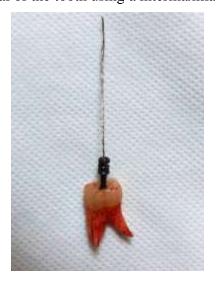
Figure 4. Removal of the tooth using a intermaxillary fixation screw.

Upon failure of apprehending the tooth with instruments, and in view of the need for an increased surgical approach or even a reintervention under general anesthesia if removal was not possible, the surgeon decided to attempt to drill the crown. It was possible to stabilize the tooth in position, through the distal positioning of a Freer periosteal elevator (Quinelato – Rio Claro – SP), preventing its posterior displacement. The dental crown was drilled with a 2.0mm drill bit and a 2.0mm intermaxillary fixation screw (Orthoface – Curitiba – PR) associated to a steel wire aciflex number 1 (Johnson & Johnson – Sao Paulo – SP Brazil) was installed. It was then possible to remove the tooth through this conservative approach (Figure 4). The patient recovered uneventfully, with remission of pain and recovery of mouth opening range.