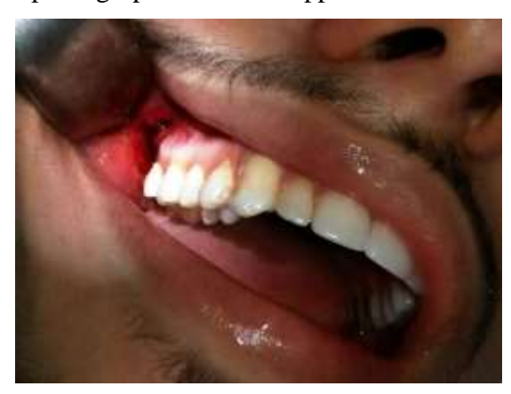
Figure 3. Transoperative photographs. Intraoral approach distal to the maxillary tuberosity.