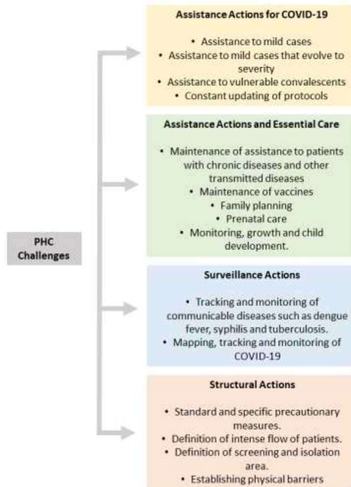
Figure 3. Diagram of PHC challenges.